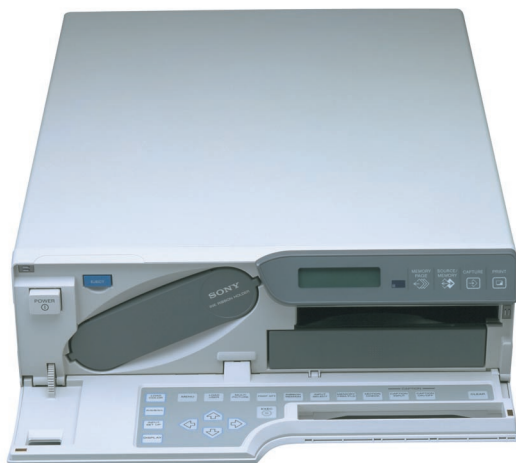
Front Open Panel

Features and specifications subject to change without notice.