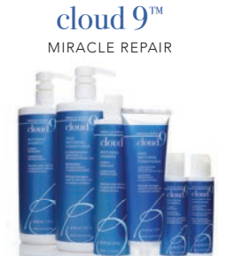
REPAIR DAMAGE SF • PB • CS • CF