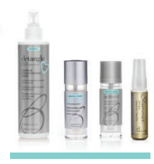
SMOOTH + SHINE