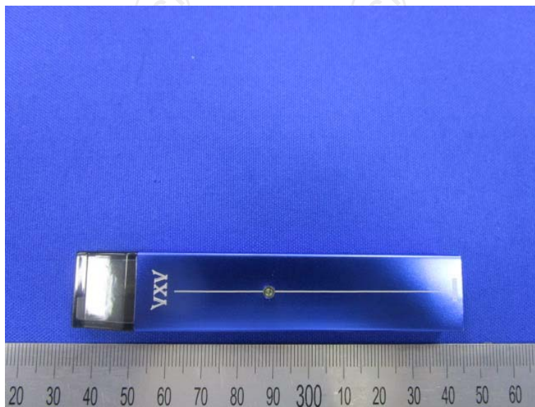
VXV POD KIT