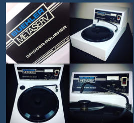
Refurbished Buehler Metaserv Grinder/Polisher