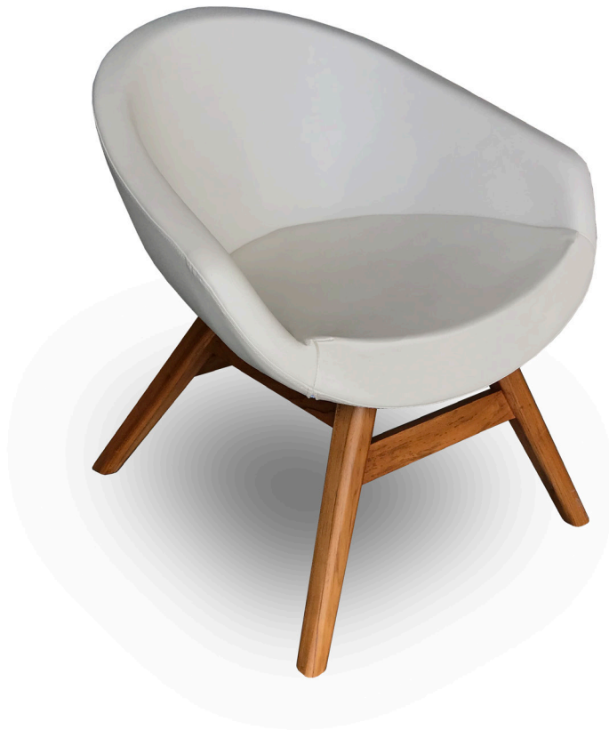
Shown in White Fabric and Teak Wood (Pieces may be available in different finishes. Please refer to the Materials section)