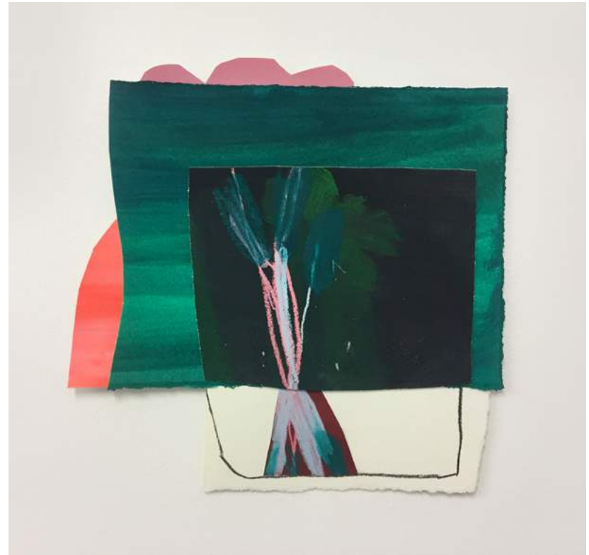
JANE TANGNEY Circular Pool Karijini 2

39.5 x 39.5 cm (light beech timber shadow boxed frame + glass). Acrylic, chinagraph and oil pastel on collaged papers