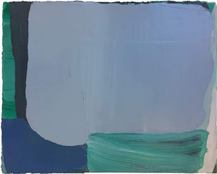
- JANE TANGNEY Crocidolite Tailings - Wittenoom