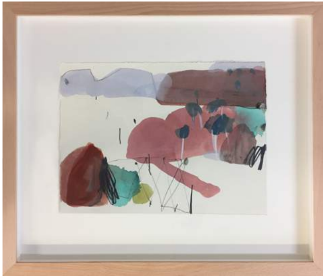
- JANE TANGNEY Field Sketch - Degazetted Town, Wittenoom

39 x 46cm (framed solid Ash timber). Mixed media on paper