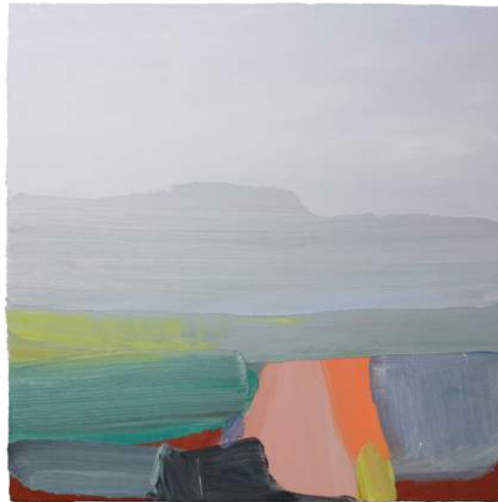
■ JANE TANGNEY Gorge Country 2