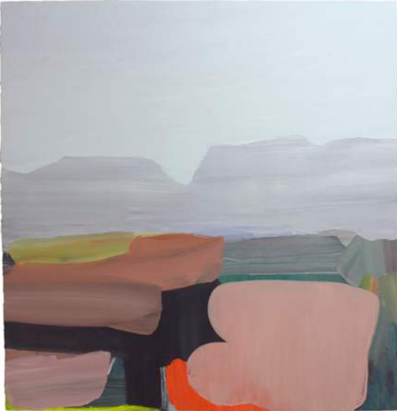
■ JANE TANGNEY Gorge Country 1