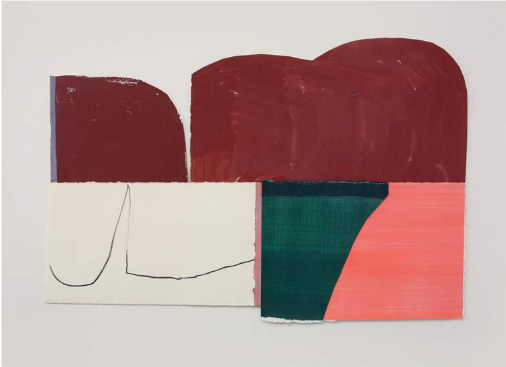
JANE TANGNEY Joffre Gorge Karijini

43 x 56 cm (light beech timber shadow box frame + glass). Acrylic, chinagraph, ochre and oil pastel on collaged papers