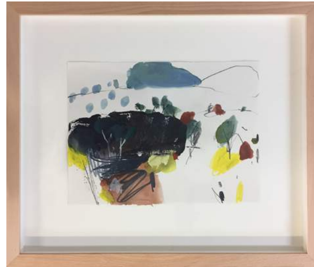
- JANE TANGNEY Field Sketch - Black Shadow, Karijini

39 x 46cm (framed solid Ash timber). Mixed media on paper