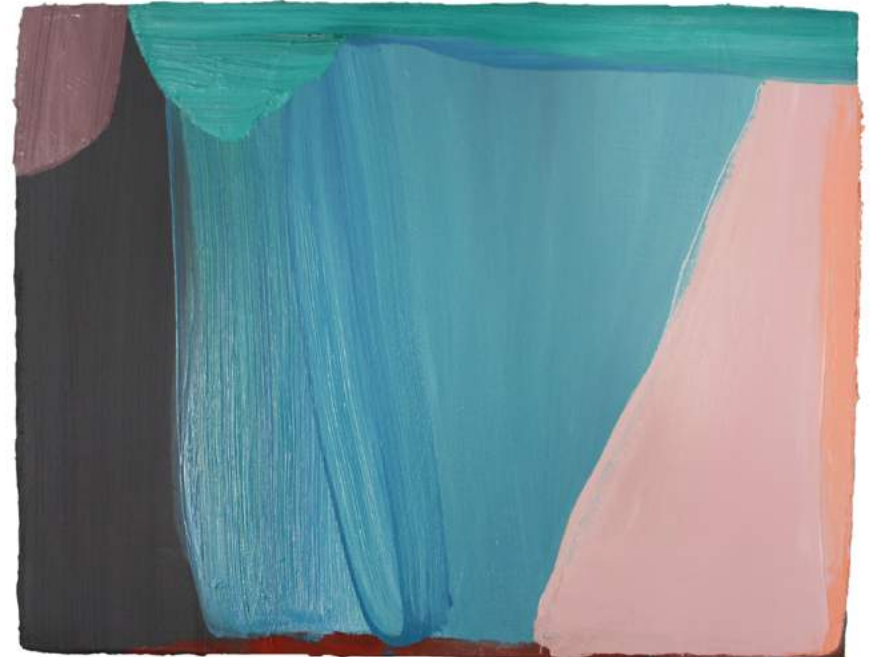
- JANE TANGNEY Kermits Pool