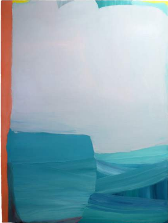
- JANE TANGNEY Embedded