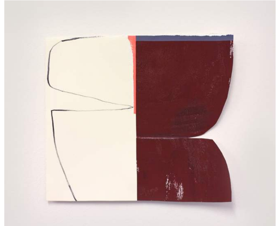
JANE TANGNEY Gorge Descent - Karijini

38 x 40 cm (light beech timber shadow box frame + glass). Acrylic, chinagraph and ochre on collaged papers