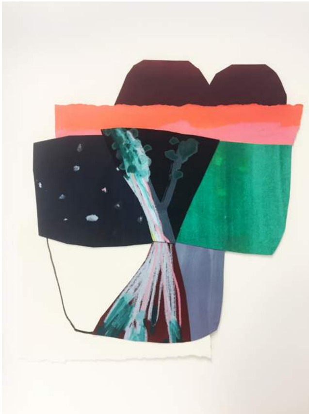
JANE TANGNEY Circular Pool Karijini 1

40 x 38.5 cm (light beech timber shadow boxed frame + glass). Acrylic, chinagraph and oil pastel on collaged papers