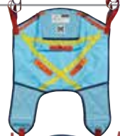
Yoke Disposable General Purpose with Head Support