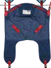
Pivot General Purpose with Head Support