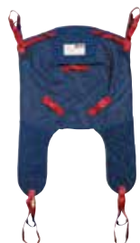
Yoke General Purpose with Head Support