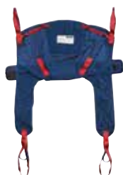
Yoke Hygiene with Head Support