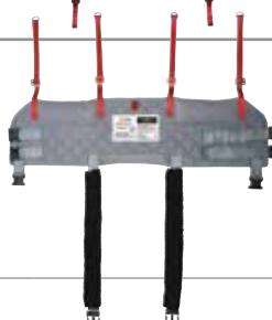
Gait Training Vest