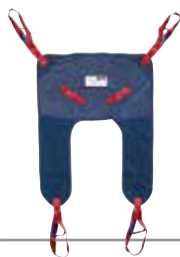
Yoke General Purpose