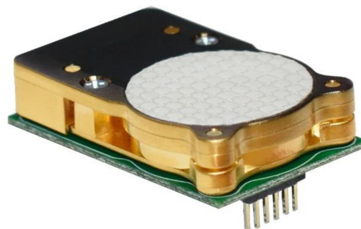
COZIR™ LP CO 2 Sensor Model GC-0027 5,000ppm