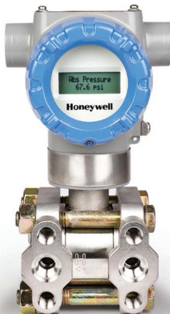
Honeywell SmartLine Transmitter

Furthermore, SMV800's fast response time of 144 ms leads to significantly tighter control. PV tracking helps to monitor PV high and low values in order to have better process insights and advanced actions to increase yields and quality.