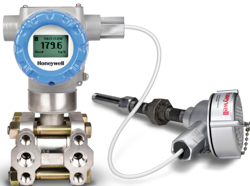
Honeywell SmartLine Multivariable SMV800 Transmitter