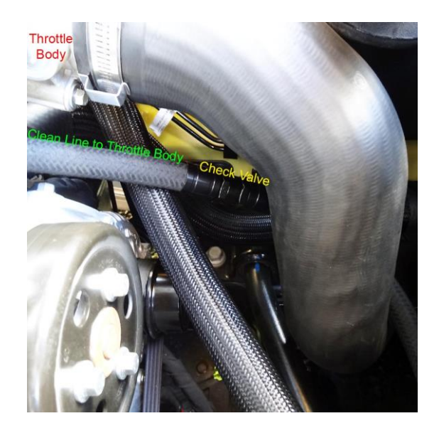
Proper hose routing of the clean line to throttle body. With everything in place tighten all clamps on billet ends.