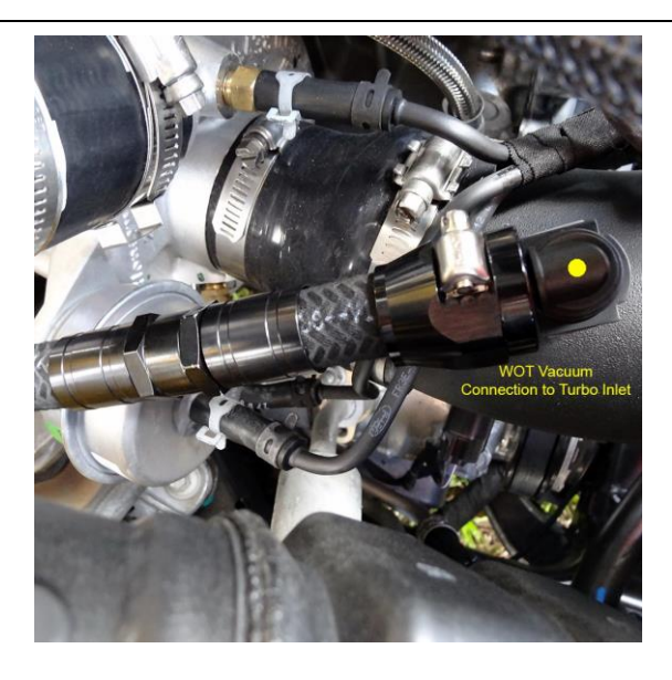
Connect the WOT vacuum line from the back of the can to the quick connect fitting you just installed on the turbo inlet.