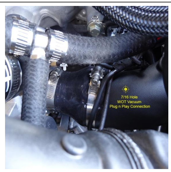
Drill a 7/16" hole in the turbo inlet tube and screw in the billet quick connect fitting. Make sure to keep any plastic from getting into the tube by either removing the tube for drilling or using grease on the drill bit.