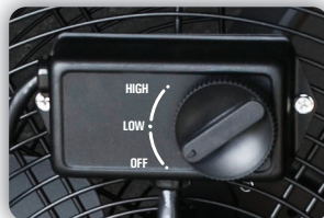
HIGH/LOW Two-Speed Dial