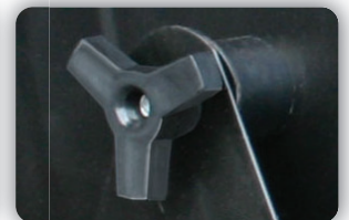
Fan Tilt Adjustment Knob

Due to our continual effort to provide the best products available and adhere to market conditions; literature, products, prices and availability are subject to change without notice.