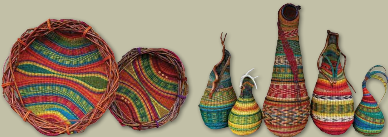
Fiesta 38" | Dream Catcher 29"