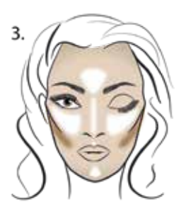
To contour, select a shade 1-2 shades darker than your skin tone. Apply to the underside of the cheekbones with an angled brush. Sweep contour from the middle ear tapering off toward the corner of the mouth.