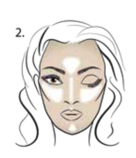
Next apply a small amount to the forehead, bridge of the nose, cupids bow and chin.