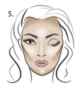
With the remaining powder, lightly sweep over the face to blend away harsh lines. Continue to apply blush and mascara to finish the look