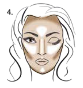
Apply this shade along the hairline, blending down onto the forehead. Use the residual powder to sweep contour along the jawline, chin and down the sides of the nose.