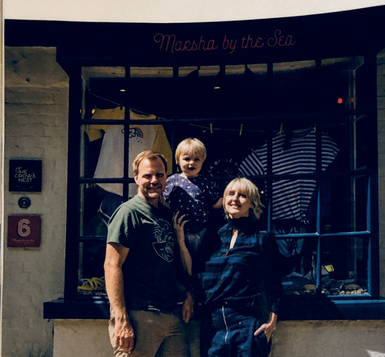
ABOVE In October 2017, having moved south from London the previous year, the couple opened their shop, Marsha By The Sea . It's a Grade II-listed 16th-century building in Lion Street, Rye BELOW The whole family are loving their new life by the coast in East Sussex – here they are enjoying the waves at Camber Sands

North Norfolk-based makers Carrier Company, an up-styled Breton sailor's hat by Béton Ciré or thick rubber wellies by Novesta. There's Petit Bateau for both kids and adults and bright, unisex rainwear by Dutch brand GoSoaky amidst rails of soft, organic cotton in the form of funky T-shirts from StepArt and kids' jerseywear by Tootsa MacGinty, which also offers a recycling service for its pre-loved clothes.