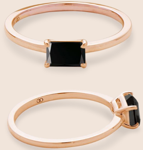
Sample Product Image