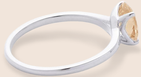
Sample Product Image