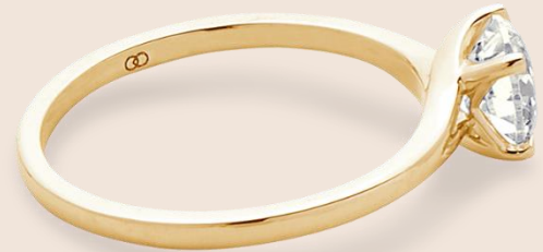
Sample Product Image