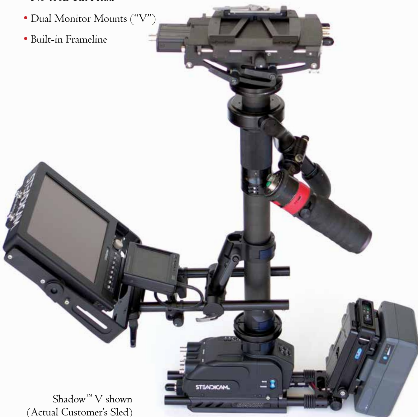
Shadow™ V shown (Actual Customer's Sled)