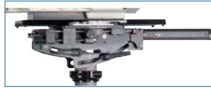
Shown Shadow™/Shadow™ 50

On the stage, the Wide Dovetail Lock has a broader, more positive grip on the dovetail plate, and the handle has a safety stop to prevent accidental release.