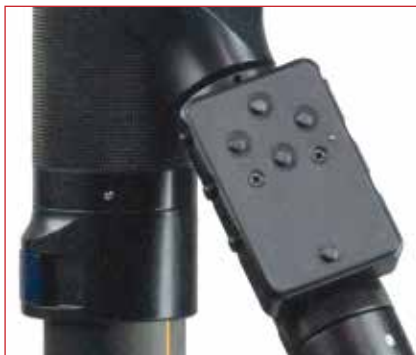
Optional Gimbal with Remote Control. (Shadow™/Shadow™ 50)

Like all our Steadicam stabilizers, the Shadow™ series is designed to be user-friendly, field-serviceable, tool-free, straightforward, and versatile so the operator can quickly and easily configure the rig to the best advantage for each shot. Change the sled length, balance, inertia, and go to low mode in a heartbeat, all without tools, extra parts, or fuss and bother. Solid, versatile, fast, with the Shadow™ series it all happens like magic on the set.