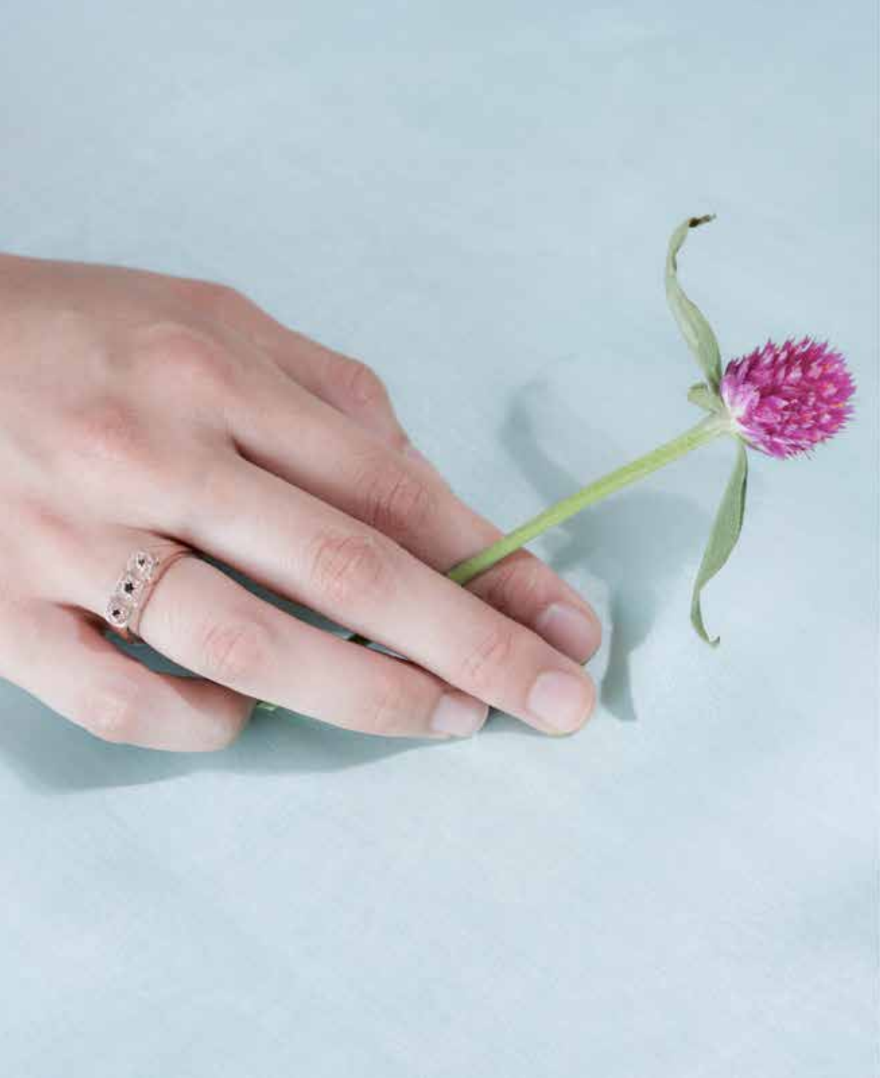
THREE STONE STAR RING THREE ROUNDED SQUARES RING WITH CUBIC ZIRCONIA STAR EMBELISHMENTS | TS02