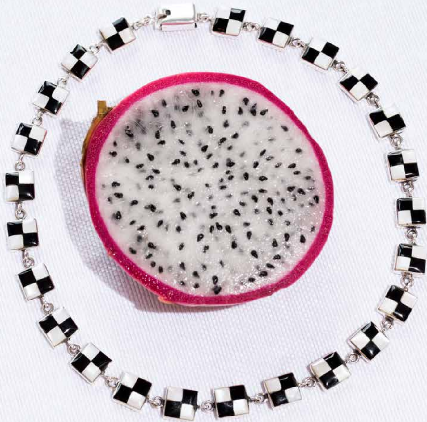
SQUARES CHOKER CHECKER LAPIDARY SQUARE LINK CHOKER | DN24