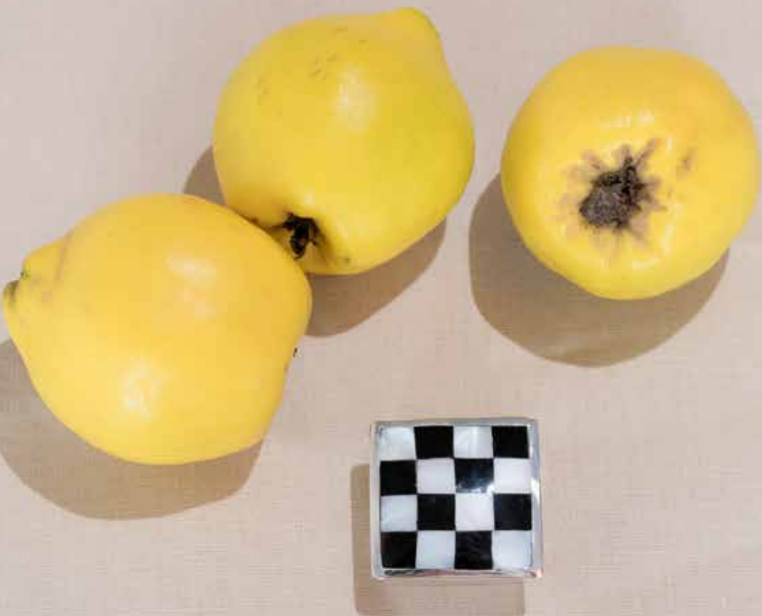
SQUARE JEWELRY BOX SQUARE SHAPED BOX WITH LAPIDARY ADORNMENT 2" | BX02