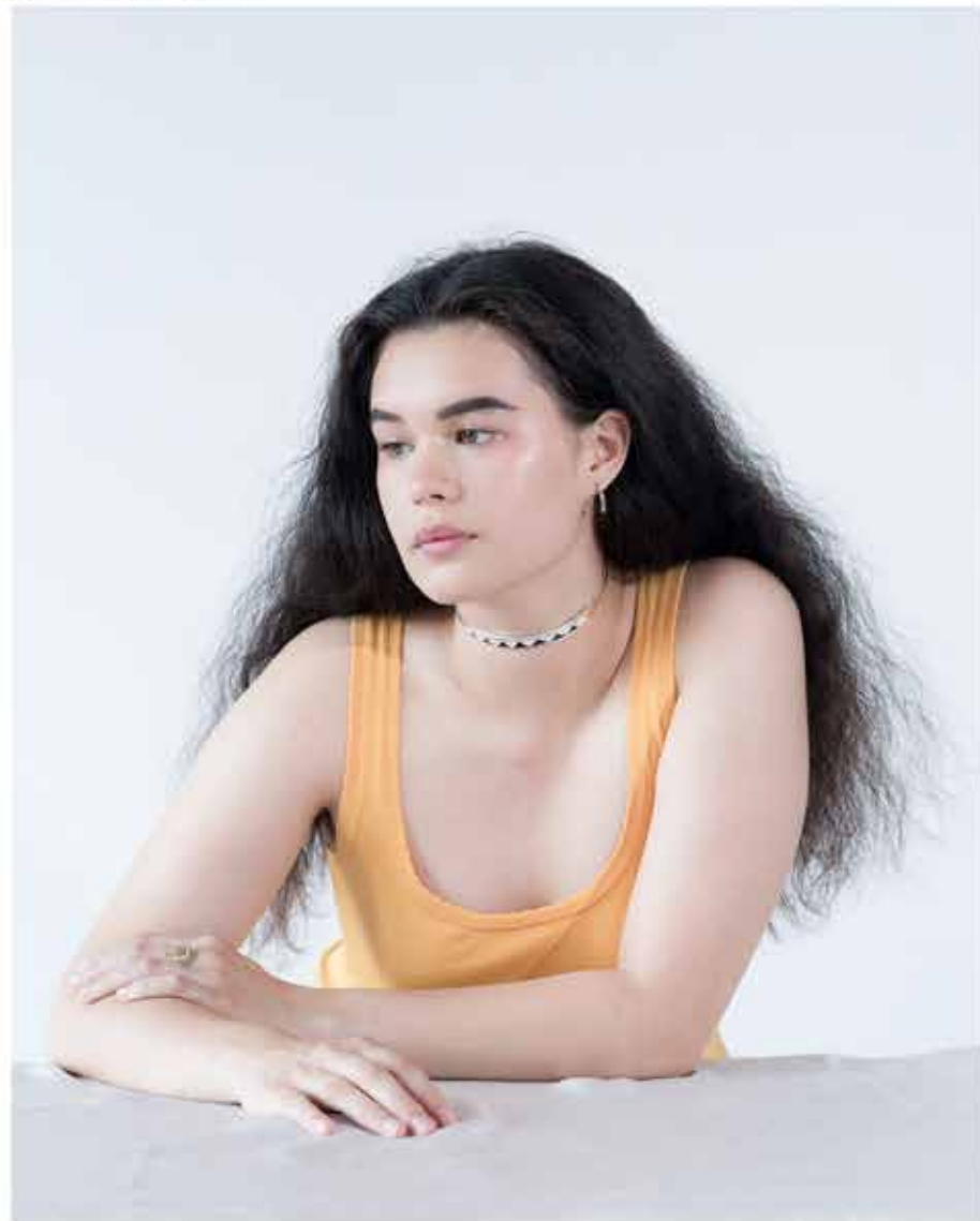
ZIGZAG CHOKER SNAP-ON CHOKER WITH ZIGZAG LAPIDARY ADORNMENT | DN28