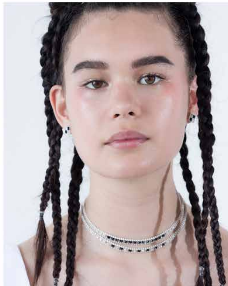
LLUVIA DE ESTRELLAS NECKLACE ARTISANAL MEXICAN CHAIN NECKLACE WITH BEAD CENTER 13" + 14" | LL21